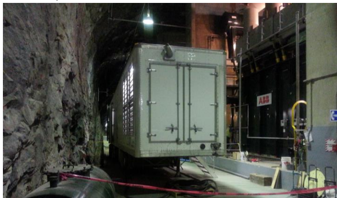
Above: TORS-6000, at underground generating station

The TORS series allows for customization of the reactivation type of regeneration system. Larger systems are ideally suited to unattended tank farm operation, where there is practically no limit to the number of columns used and hence volume processed.