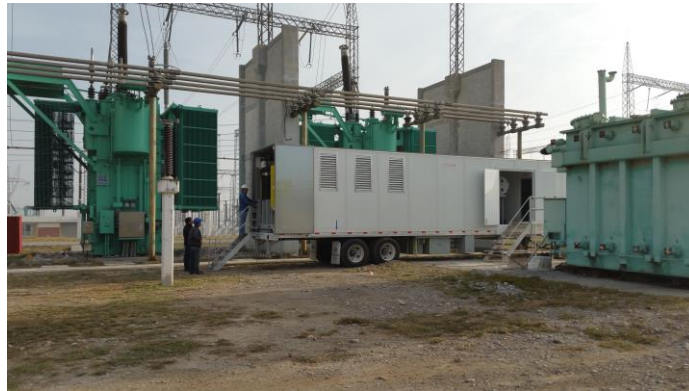
Above: TORS-6000 at sub-station

Mobile systems are usually limited by the prevailing road transport regulations and may limit systems to 44 ton in weight or 53-foot in length. Practically, this tends to limit the system flow rates to around 10,000 litres per hour.