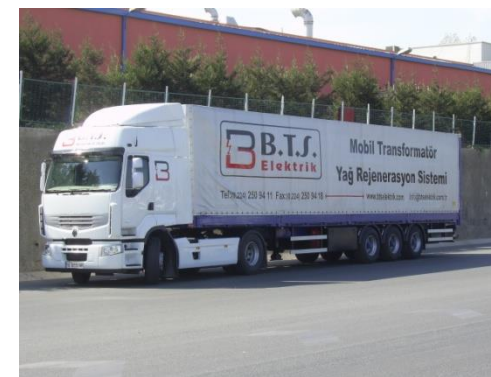
Left: TORS-4000 in canvas-side trailer