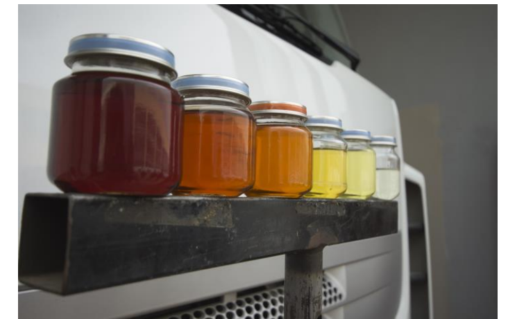
Above: Various stages of regenerated transformer oil