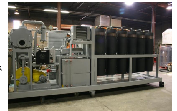
Right: TORS-2000, skid-mounted